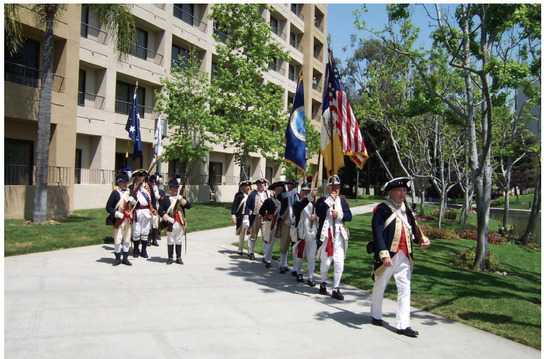
Color Guard parading in Costa Mesa at CASSAR meetings

In passing, several of those residing in the area stopped to thank those involved for the clean up effort.